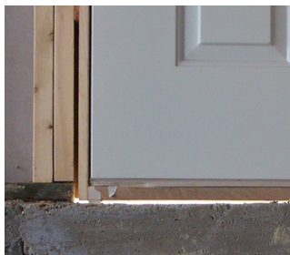
Job sites aren't always square, level & plumb.