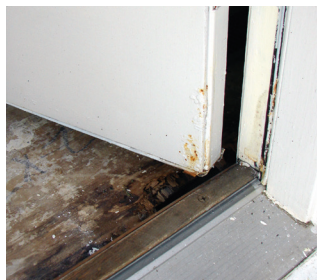
Missing parts cause big problems.