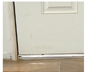
When it comes to adjustments, everyone gets cold feet.