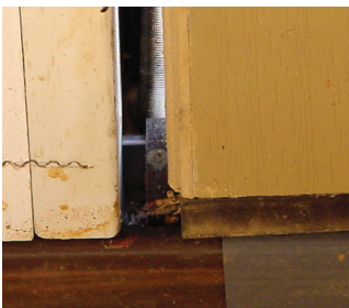
Margins are rarely, if ever, perfect.

Your customers want a sill that never has to be adjusted. They want a sill that performs when the opening isn't perfect. They want Z-AC.